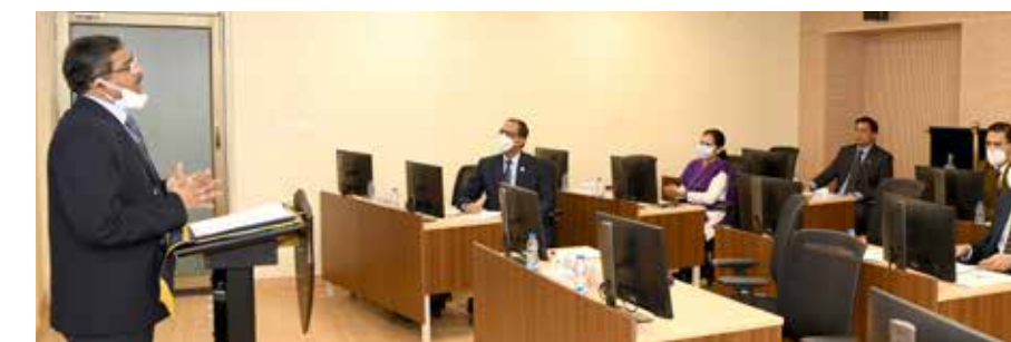
DG, BPR&D, speaking at the interactive session at STAC with Chiefs of State/UT Police and CAPFs

to-back events on space technology based applications for operations planning in association with the Advanced Data Processing Research