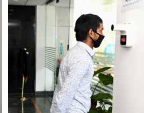
Wall mounted thermal scanner at BPR&D Reception