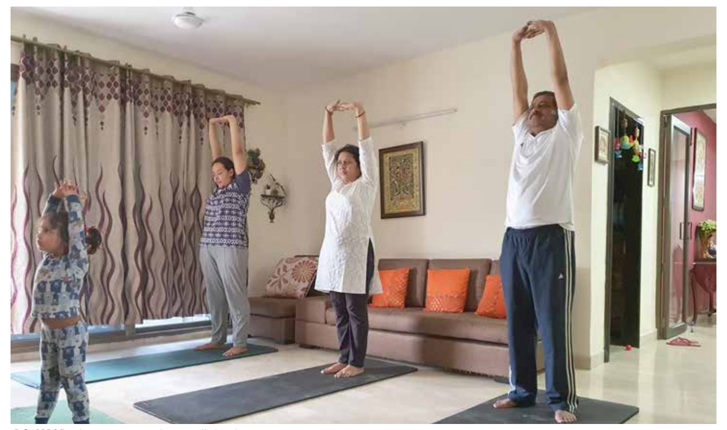
DG, BPR&D, at yoga session @home with family

"Yoga enhances our quest for a healthier planet. It has emerged as a force for unity and deepens the bonds of humanity. It does not discriminate. It goes beyond race, colour, gender, faith and nations.... Anybody can embrace Yoga. All you need is some part of your time and empty space. Yoga is giving us not only the physical strength, but also mental balance and emotional stability to confidently negotiate the challenges before us....."